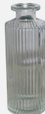
RIBBED BUD VASES

$1.25 - $1.75 #C203-7 - #C203-9 - #C203-10