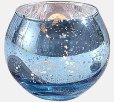
BLUE MERCURY VOTIVES