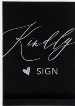
BLACK AND WHITE GUESTBOOK SIGN