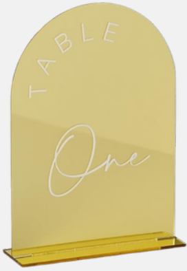
GOLD MIRRORED ARCH TABLE NUMBERS 1-20