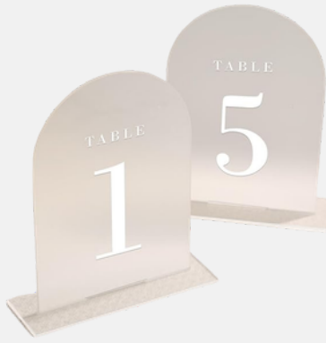
FROSTED TABLE NUMBERS 1-20