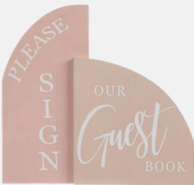
PINK ARCHED GUESTBOOK SIGN