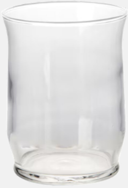
WIDE MOUTH VASE