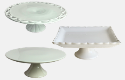
WHITE CAKE STANDS ASSORTED SIZES