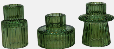
GREEN ASSORTED CANDLE HOLDERS FITS TEA LIGHT AND TAPER CANDLES.