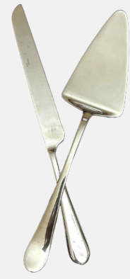
SILVER CAKE KNIFE SET