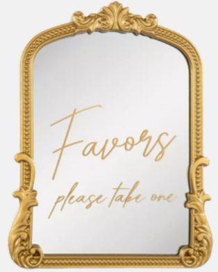
GOLD FRAME MIRROR FAVORS SIGN