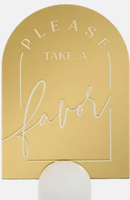
GOLD MIRRORED ARCH FAVORS SIGN