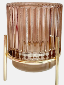
MAUVE + GOLD VOITVES