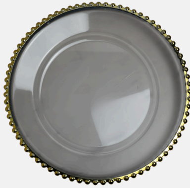
GOLD BEADED CHARGER CLEAR ACRYLIC CHARGER WITH GOLD BEADED RIM