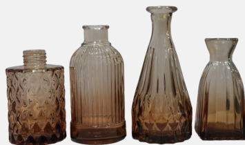
AMBER ASSORTED BUDVASES (OMBRE)