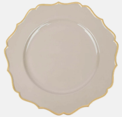
TAUPE AND GOLD CHARGER ACRYLIC