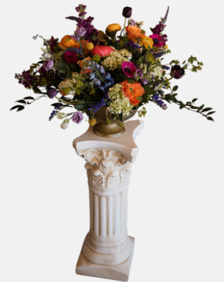
COLUMN PEDESTALS 2 AVAILABLE; FLOWERS NOT INCLUDED