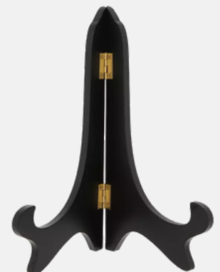
BLACK TABLE EASEL 3 AVAILABLE