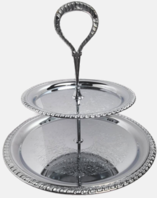
SILVER DESSERT TOWER 8 in. plate dia. (top) x 12 in. plate dia. (bottom) x 11 in (height)