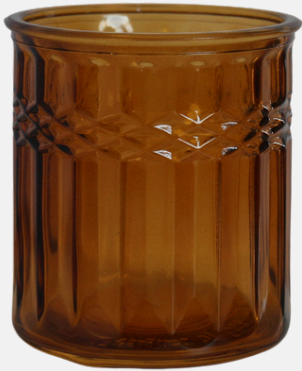
AMBER CRYSTAL CUT VOTIVES