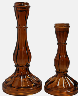
AMBER CANDLESTICK HOLDERS 6.5" & 8.5"