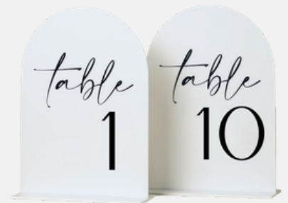
WHITE ARCHED TABLE NUMBERS 1-30