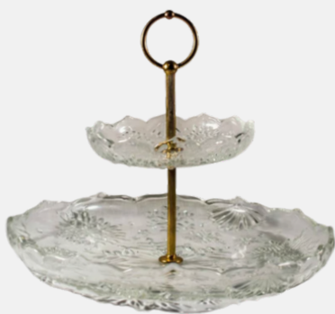
CLEAR DESSERT TOWER