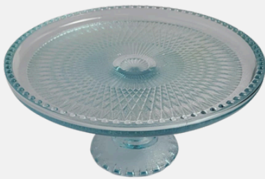
BLUE CAKE STAND 10 in. plate dia x 5 in. (height)