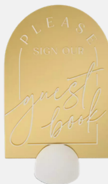
GOLD MIRRORED ARCH GUESTBOOK SIGN