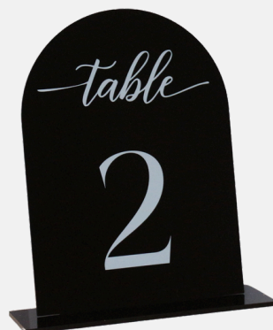
BLACK AND WHITE TABLE NUMBERS 1-20