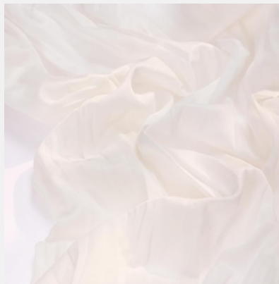
10FT CHEESECLOTH RUNNERS - IVORY FLOOR LENGTH FOR 6" ROUND + LAP LENGTH FOR 8" RECTANGLE TABLES