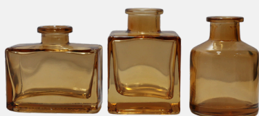
AMBER ASSORTED BUDVASES (MODERN)