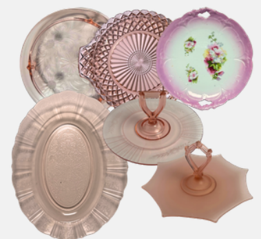
PINK PLATES + TRAYS ASSORTED SIZES