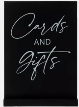
BLACK AND WHITE CARDS AND GIFTS SIGN