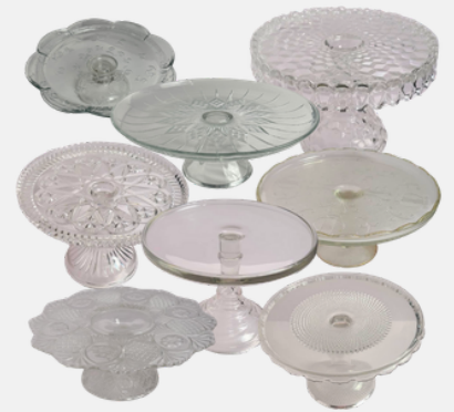
CLEAR CAKE STANDS ASSORTED SIZES