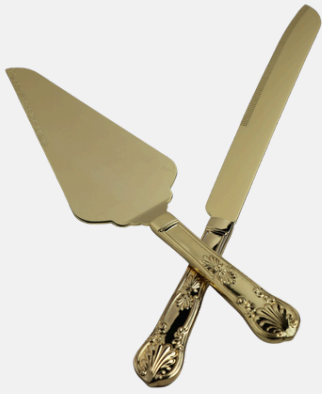
GOLD CAKE KNIFE SET