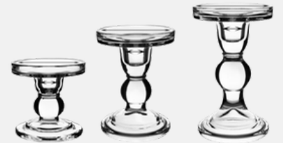
GLASS CANDLE HOLDERS FITS TAPER AND PILLAR CANDLES. 3.75", 4.5" & 5"