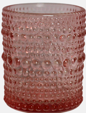
PINK BUBBLE VOTIVES