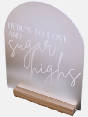
FROSTED DESSERT SIGN