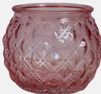
PINK GEOMETRIC VOTIVES