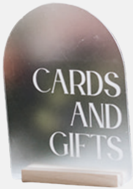
FROSTED CARDS AND GIFTS SIGN