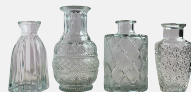
CLEAR ASSORTED BUDVASES