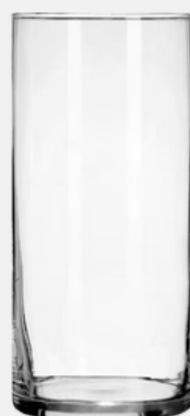
HURRICANE VASES 7", 9" & 10"

$1.25 - $1.75 #C203-7 - #C203-9 - #C203-10