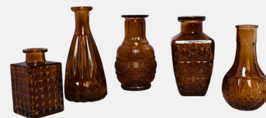
AMBER ASSORTED BUDVASES (FARMHOUSE)