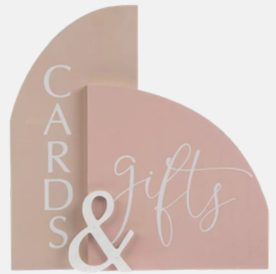
PINK ARCHED CARDS AND GIFTS SIGN