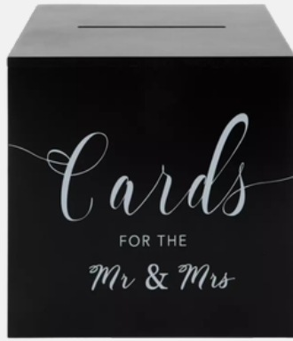
BLACK AND WHITE CARD BOX