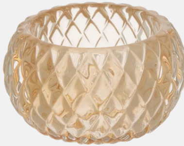
CHAMPAGNE DIAMOND VOTIVES