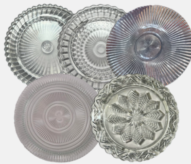
CLEAR PLATES + TRAYS ASSORTED SIZES