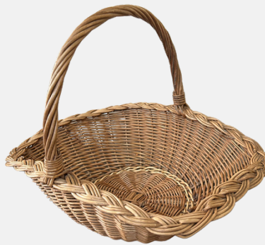
WICKER FLOWER GIRL BASKET