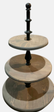
WOODEN DESSERT TOWER