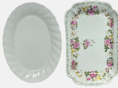
WHITE PLATES + TRAYS ASSORTED SIZES