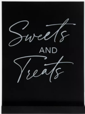
BLACK AND WHITE DESSERT TABLE SIGN