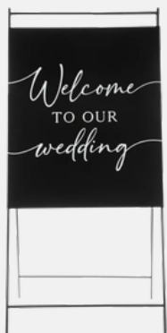
BLACK AND WHITE WELCOME SIGN