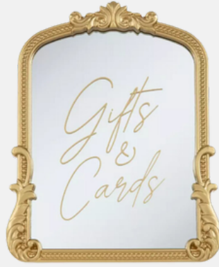
GOLD FRAME MIRROR GIFTS + CARDS SIGN