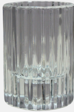
RIBBED GLASS VOTIVE