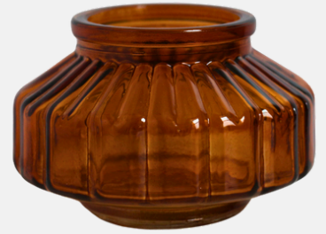
AMBER LANTERN VOTIVES