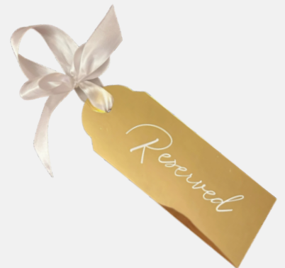
GOLD MIRRORED RESERVED SIGNS