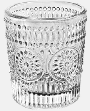
VINTAGE FARMHOUSE VOTIVES