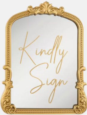
GOLD FRAME MIRROR GUESTBOOK SIGN