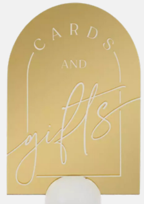
GOLD MIRRORED ARCH CARDS AND GIFTS SIGN