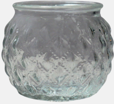
CLEAR GEOMETRIC VOTIVES